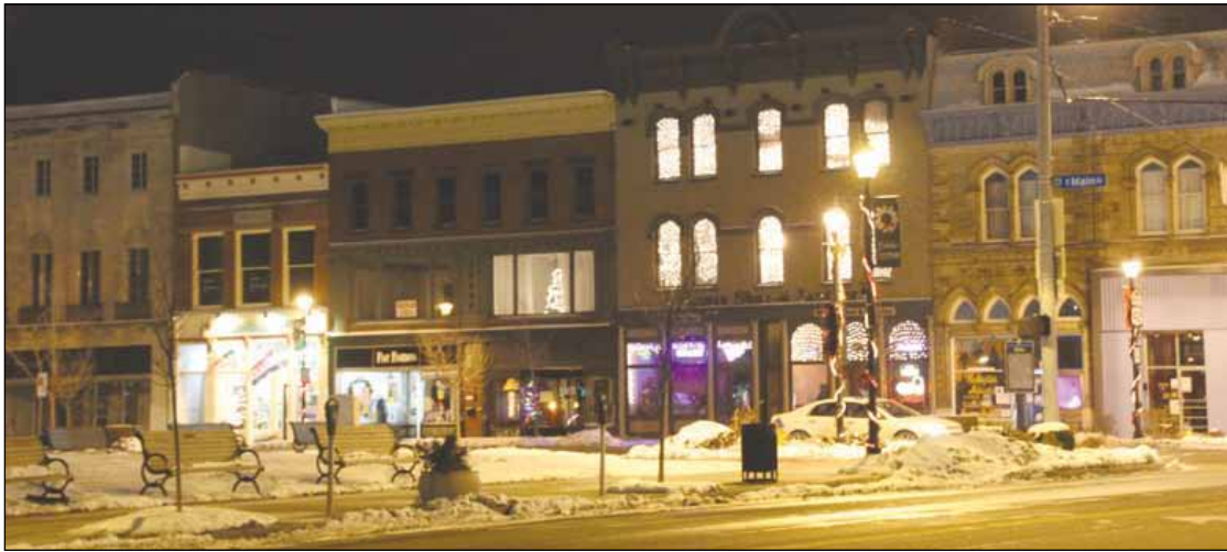
Downtown businesses were decorated for last year's Hometown Christmas.