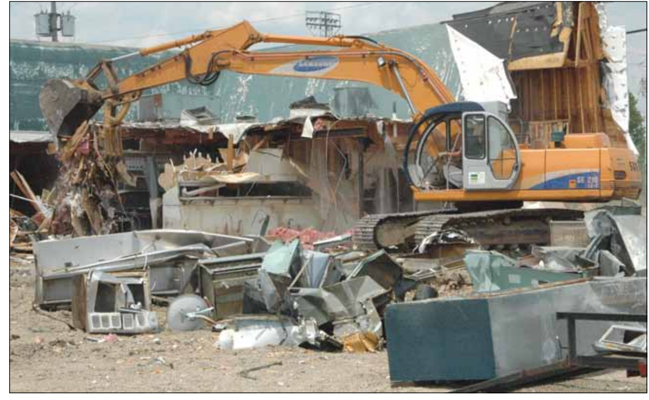
The former Perkins restaurant, vacant for nearly two years, is being torn down and will be replaced by an O'Reilly Auto Parts store later